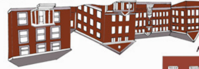
Dr. John C. Page Elementary School