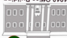
1910 Office Building Annex and senior housing in the back