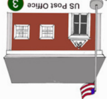
US Post Office