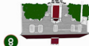
William Hill House 1780 West Newbury Historical Society

Historic home of William Hills, a cooper by trade, is now the headquarters of the West Newbury Historical Society. The herb garden is based on a design from the Plimoth Plantation, and contains over 50 varieties of herbs grown during the 18th century for their pharmaceutical, aromatic and therapeutic qualities.