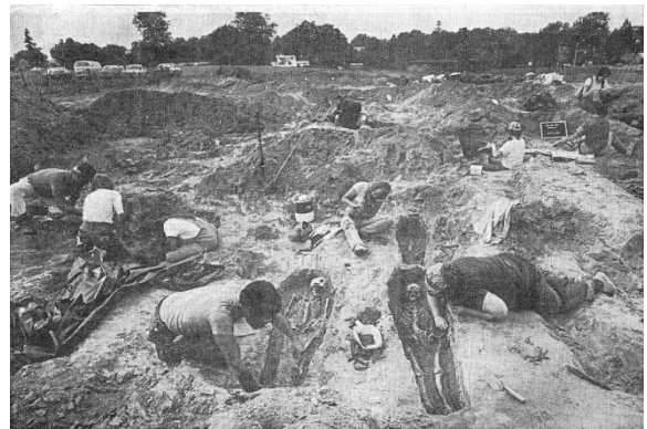
Alms house Cemetery in Rochester, NY, under excavation after having encountered a bulldozer