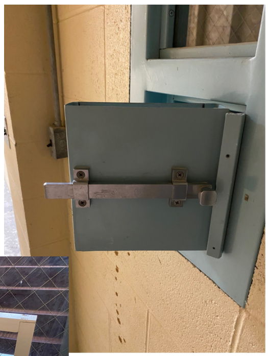
Cellblock door and pass-through.

With the founding of the regional school district, the Central School found a new purpose as a Town Hall, the cafeteria most notably being replaced by the West Newbury Police Station.