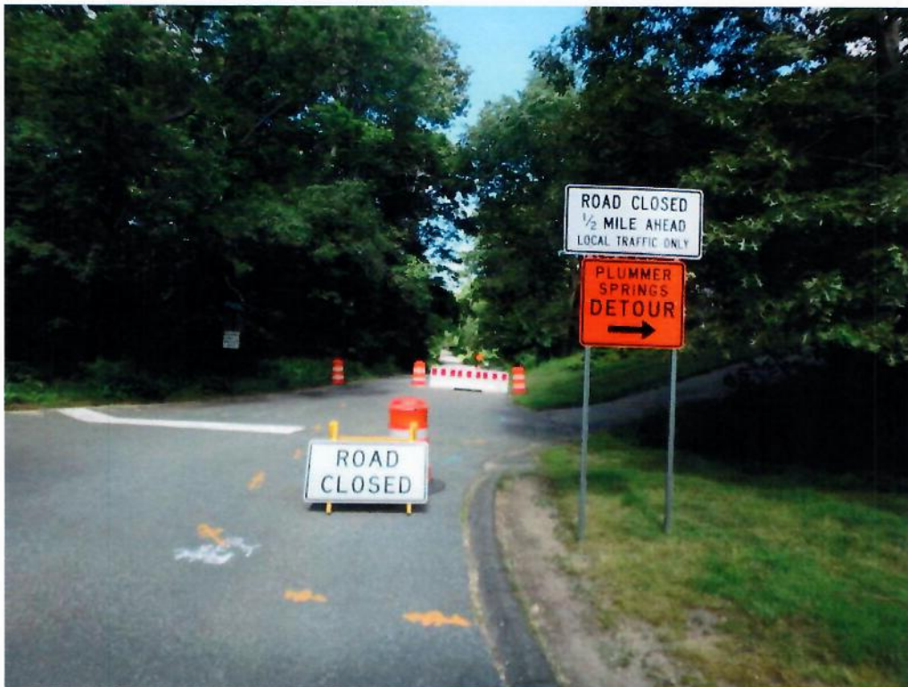
Photo 6: Road closed and detour signs at the intersection of Turkey Hill Road and Plummer Spring Road 1/2 mile east of the bridge.