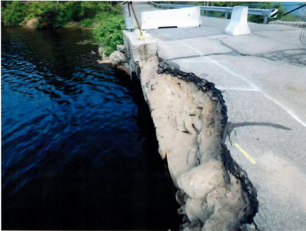
Photo 3: Failure of the spandrel wall at the southeast corner of the bridge.