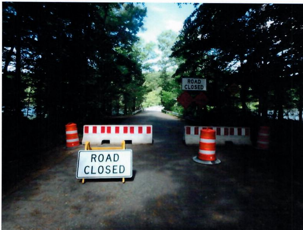
Photo 8: Road closed signs and jersey barriers installed at the east end of the bridge preventing vehicle traffic.