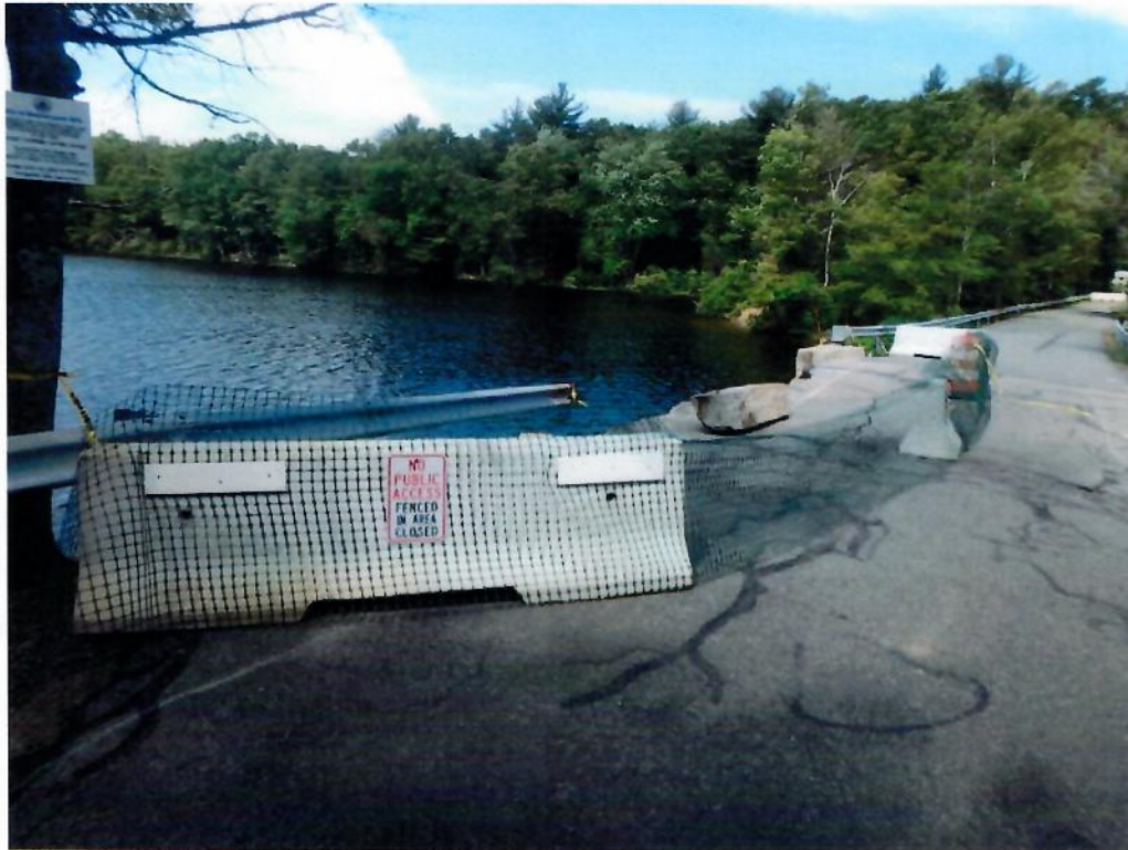
Photo 1: Jersey barriers with construction/snow fencing blocking off the failure of the spandrel wall at the southeast corner of the bridge.