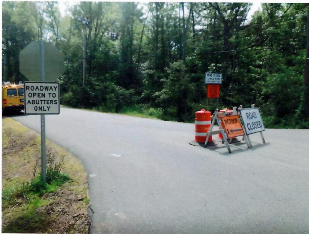
Photo 7: Road closed and detour signs at the intersection of Middle Street and Garden Street about 1/2 mile west of the bridge.