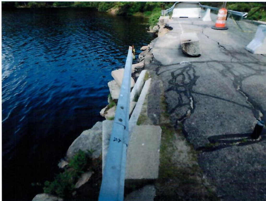
Photo 2: Failure of the spandrel wall at the southeast corner of the bridge.