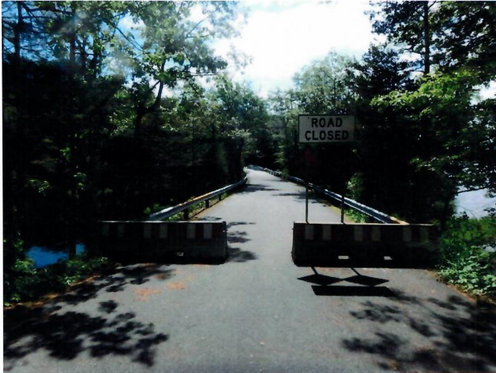
Photo 9: Road closed signs and jersey barriers installed at the west end of the bridge preventing vehicle traffic.