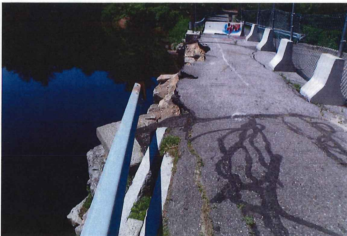
Photo 2: Inside the restricted area; spandrel wall has failed and material continues to fall into channel.