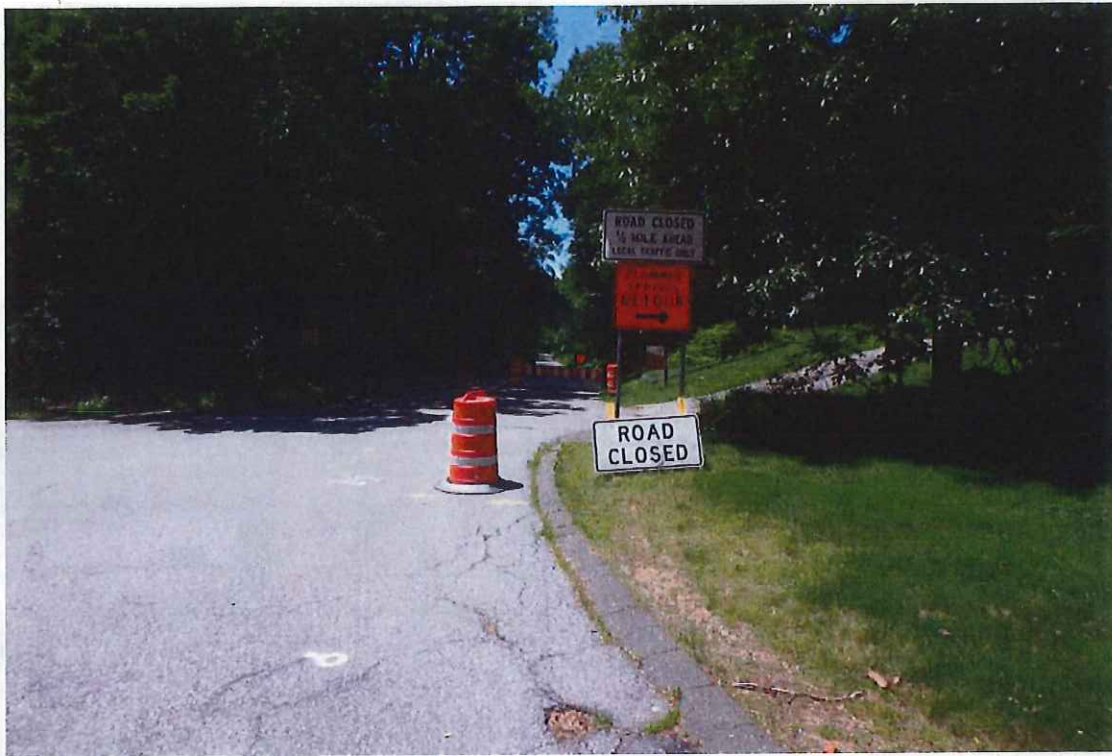
Photo 5: Typical signage at cross streets. Intersection of Turkey Hill Road east of bridge shown.