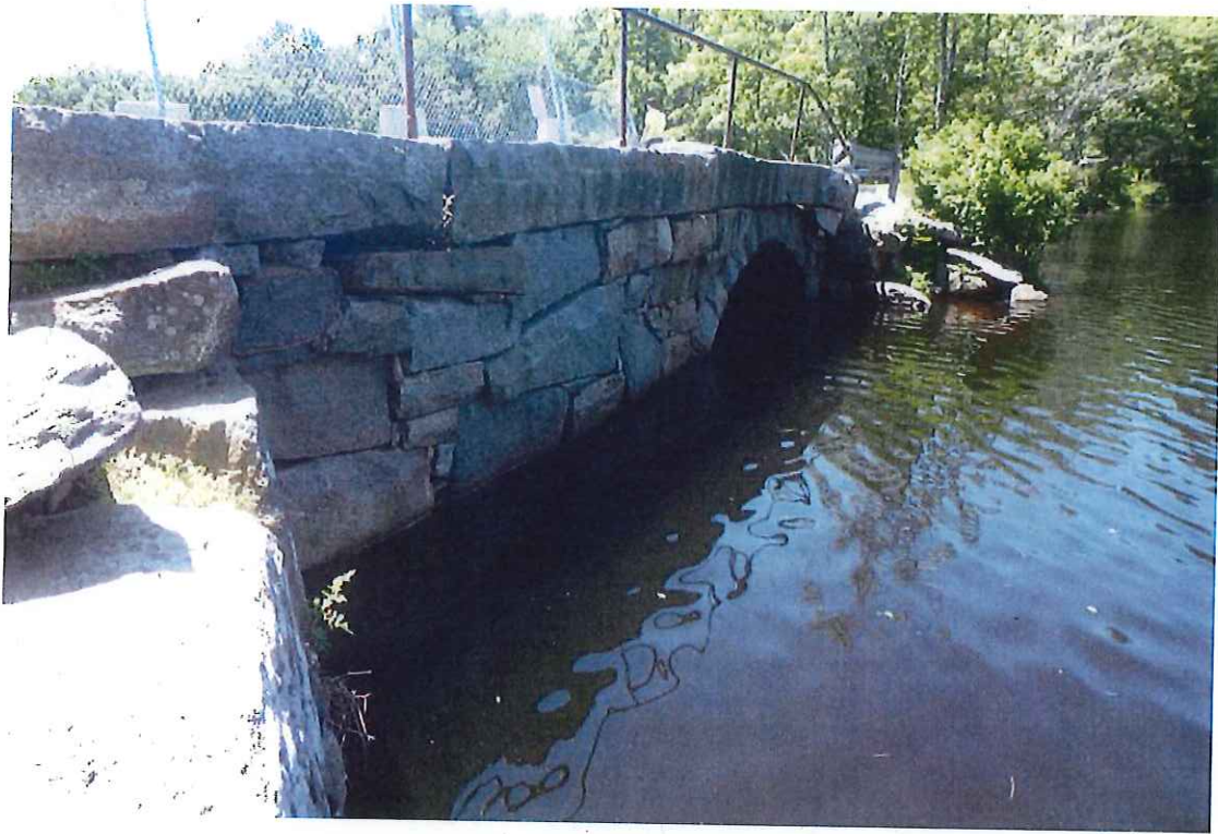
Photo 9: Bulging of the north spandrel wall both east and west of the arch.