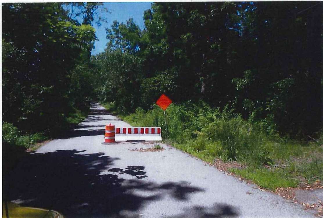
Photo 6: Typical barrier and signage approaching the bridge. East approach shown.