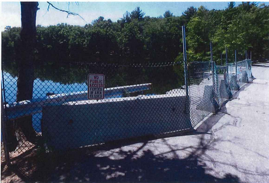
Photo 1: Jersey barriers and chain link fencing is in place to prevent pedestrian access to the failed portion of the bridge.