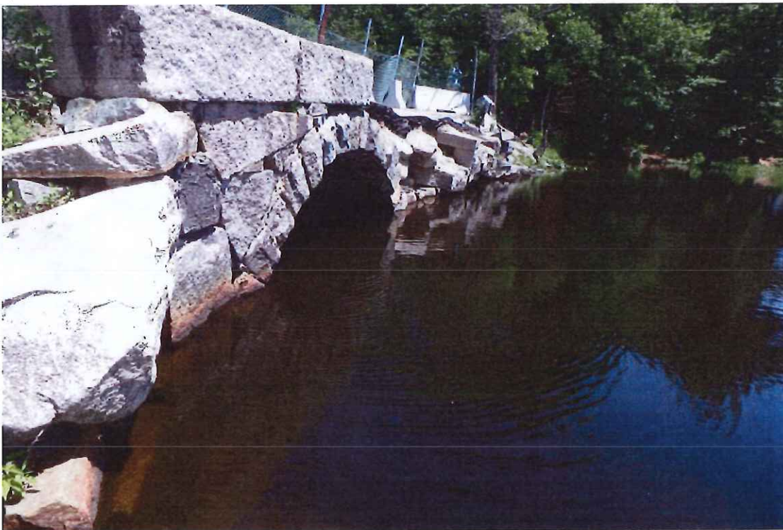
Photo 4: View of the collapsed area from the southwest wingwall. Note the severe displacement of stones on the southeast wingwall area.