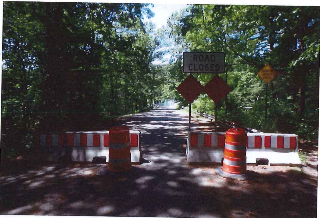
Photo 7: Typical barrier and signage at bridge preventing vehicular traffic. East approach shown.