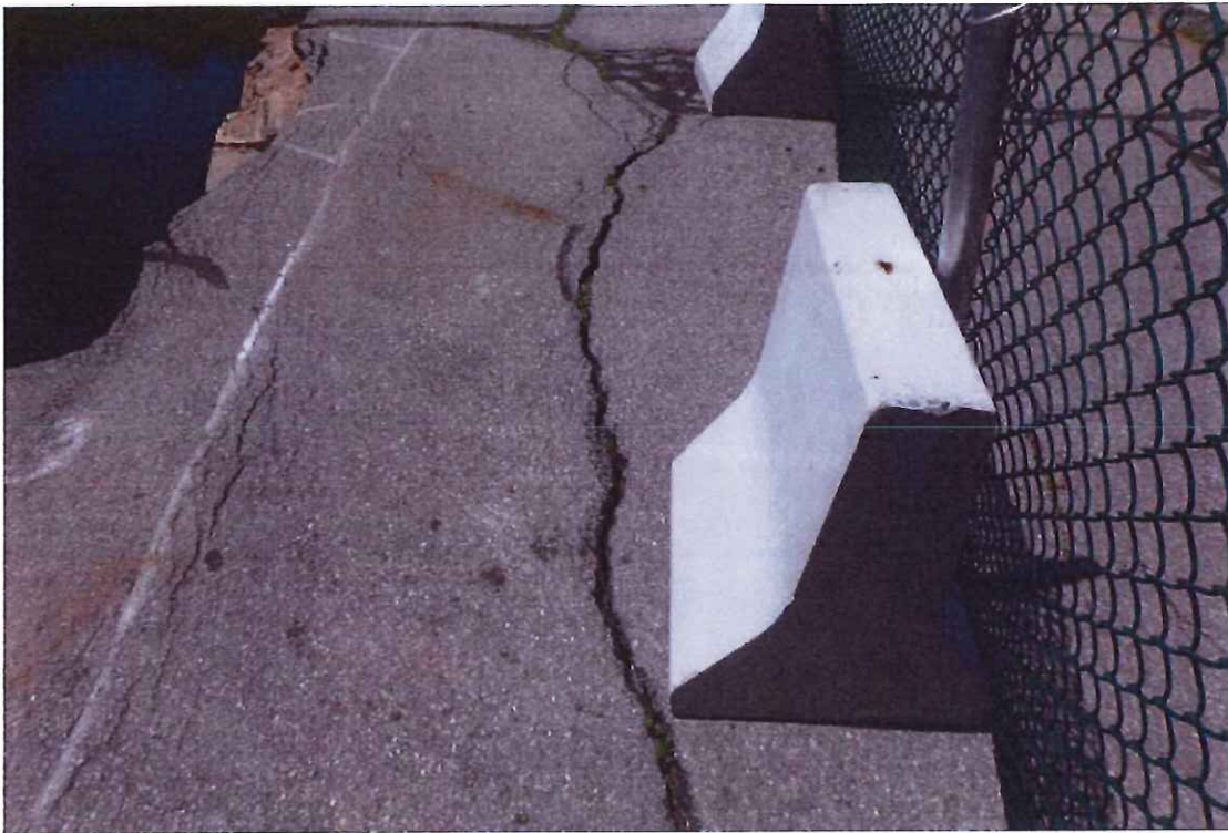
Photo 3: Heavy cracking in the asphalt adjacent to the collapsed area.