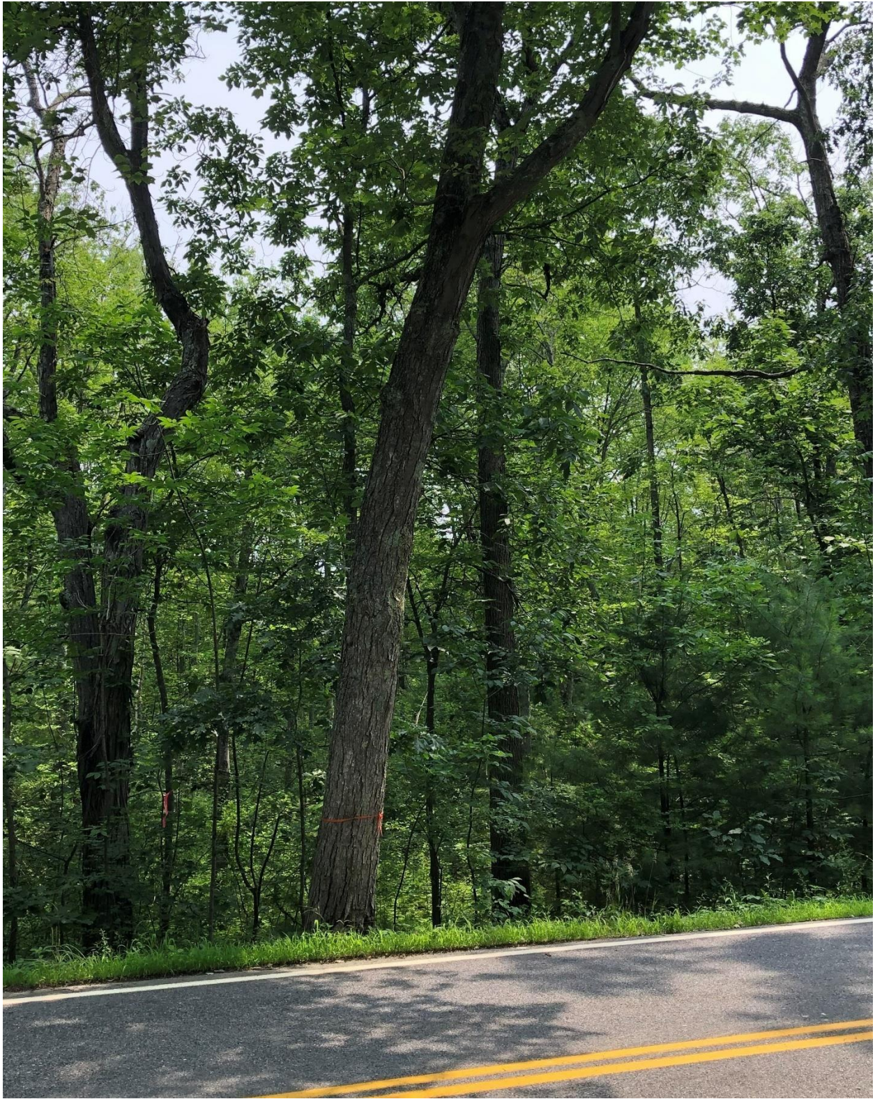
Flagged Red Maple Located Across the Street from the Driveway of 290 Middle St.