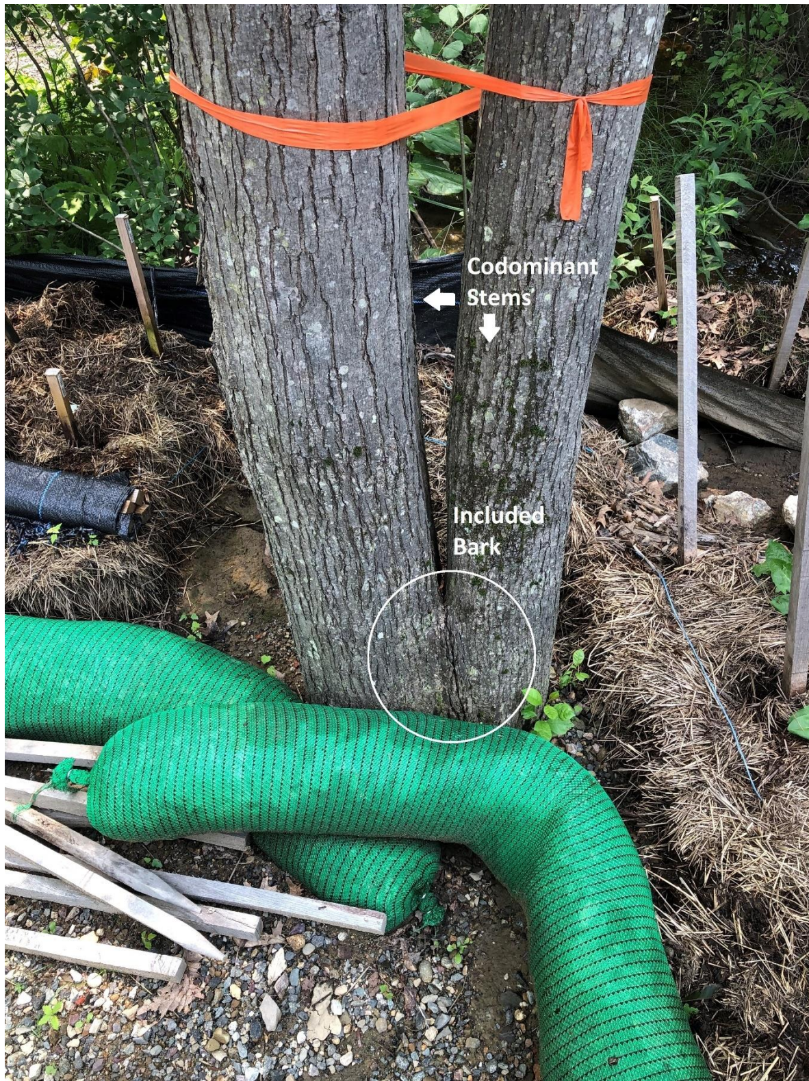
Defects of the Red Maple are Shown Above