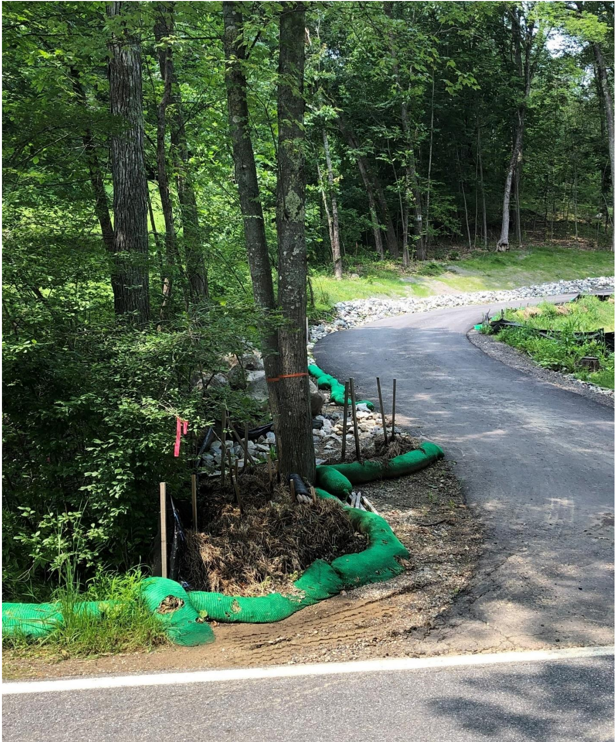
8" + 10" Red Maple to be Removed and Estimated Location of Pole : 124 (Location Has Not Been Steaked)