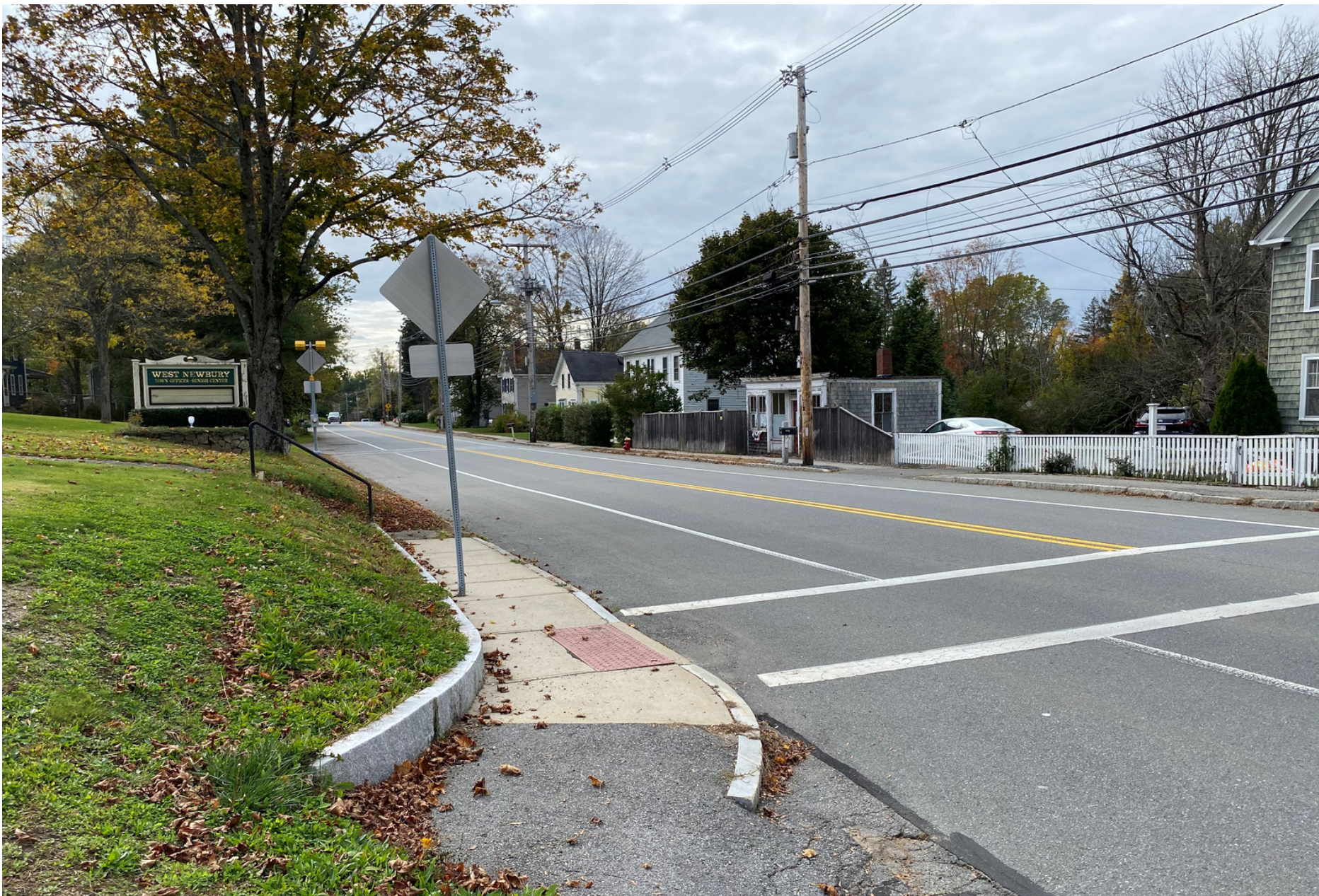
Image above: The crosswalks and signage around Town Offices were enhanced during Spring 2023. As part of the broader corridor study, this location and others will be considered for potential Rapid Flasher Beacons (RFBs).

During Spring 2023, the Town successfully petitioned MassDOT to install improved signage giving drivers more advanced notice of crosswalks at Town Offices, as well as to repaint crosswalks as part of its annual program. In June 2023, the Town obtained $30,000 with a goal of improving the pedestrian crossing at Page School and Pipestave, as a result of a Traffic Safety Audit conducted in 2022.