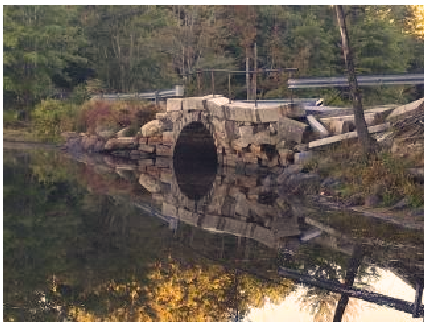
Images of the collapsed bridge.