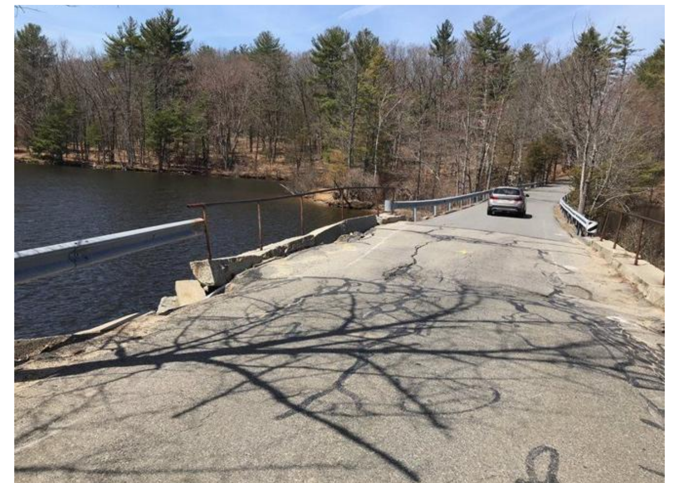
Above: An SUV traversing the Bridge prior to closure.

In early 2023, the Middle Street Bridge project became fully permitted after a lengthy process. Due to the work taking place within sensitive environmental areas, including a public drinking water source, the project required permitting from MassDEP, MassDOT, Massachusetts Historical Commission, the Massachusetts Executive Office of Energy and Environmental Affairs (under MA Environmental Policy Act, or MEPA), the U.S. Fish & Wildlife Services, the U.S. Army Corps of Engineers, and both the West Newbury and the Newburyport Conservation Commissions. It is now, in the words of the Town Manager, "shovel ready", and can be put out to bid once full funding for project construction is secured.