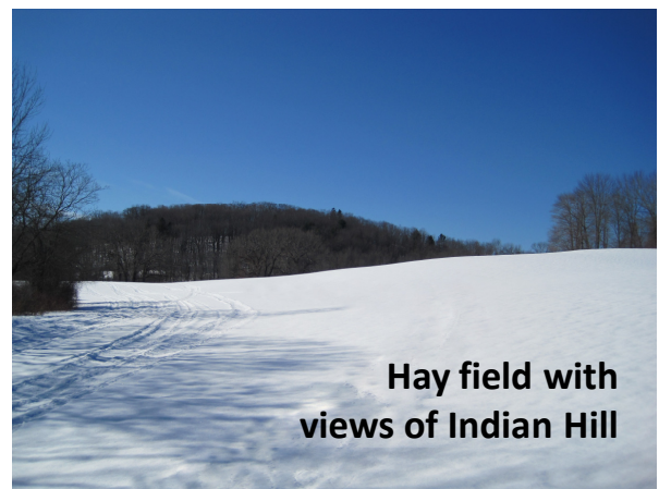
Hay field with views of Indian Hill

To bypass the house lot, a new trail would have to pass thru wetlands; access to this scenic overlook of the Artichoke River and the surrounding forest would be lost.