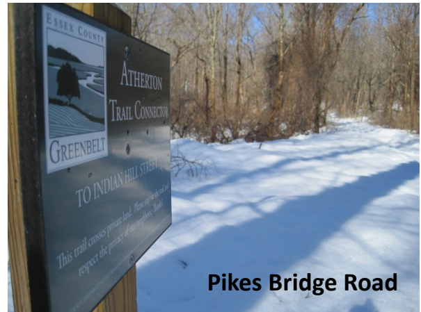
Pikes Bridge Road