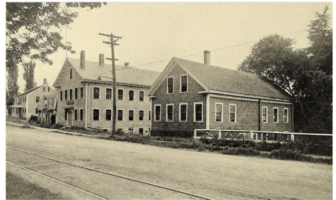
COMB FACTORY OF S. C. NOYES AND COMPANY, WEST NEWBURY Showing old comb shop in the background and storehouse in the foreground