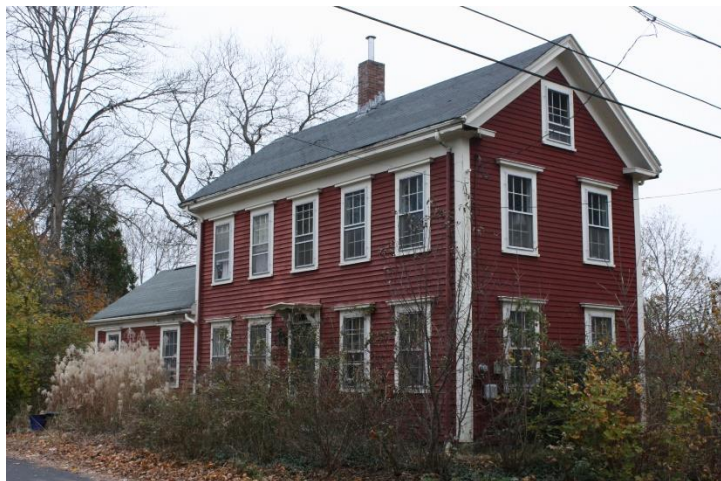
Photo 2. 1 Sullivan's Court. View looking northwest.