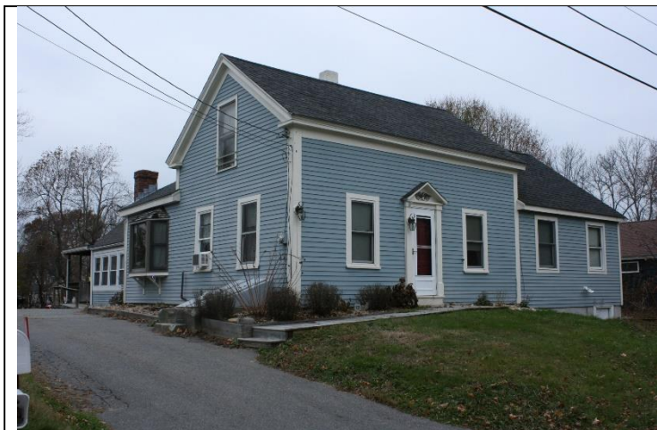
Photo 6. 26 Whetstone Street. View looking west.