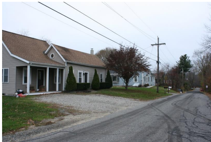
Photo 3. 24 and 26 Whetstone Street. View looking northwest.