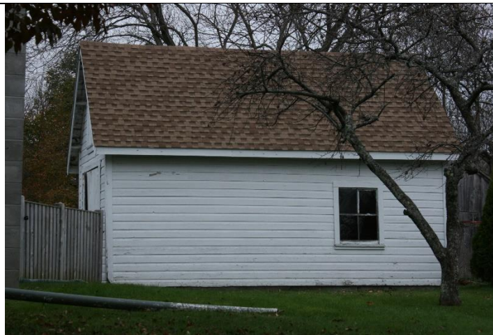
Photo 5. 24 Whetstone Street. Garage. View looking southwest.