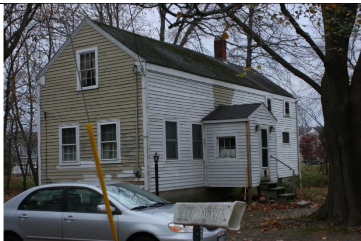
Photo 7. 32 Whetstone Street. View looking northwest.