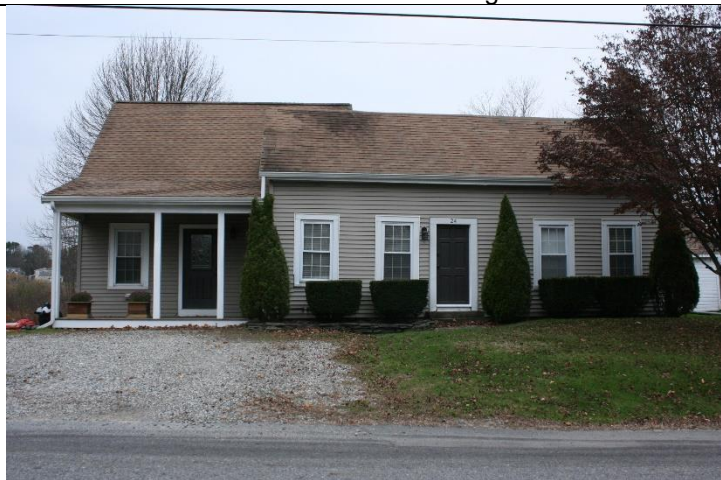
Photo 4. 24 Whetstone Street. View looking southwest.