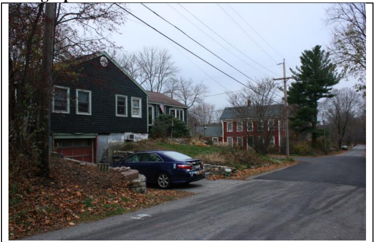
Photo 1. Intersection of Whetstone Street and Sullivan's Court. View looking northwest. 28 Whetstone Street at left. 1 Sullivan's Lane at right.