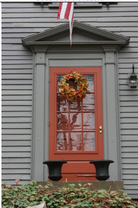
Detail of main entrance.