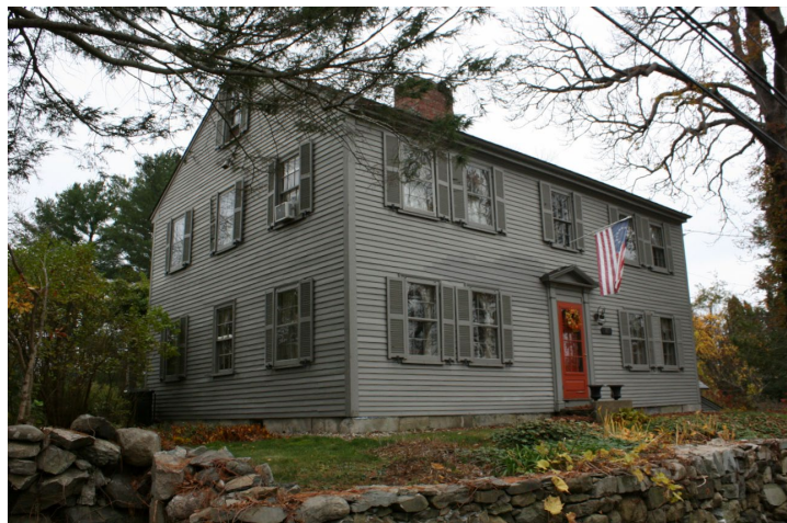
Southeast and façade (northeast) elevations.