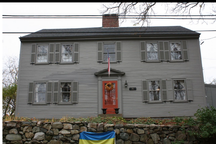
Façade (northeast elevation).