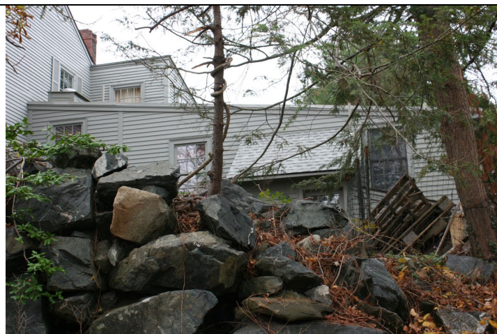
Addition on right side (northwest elevation) of main block): Façade.