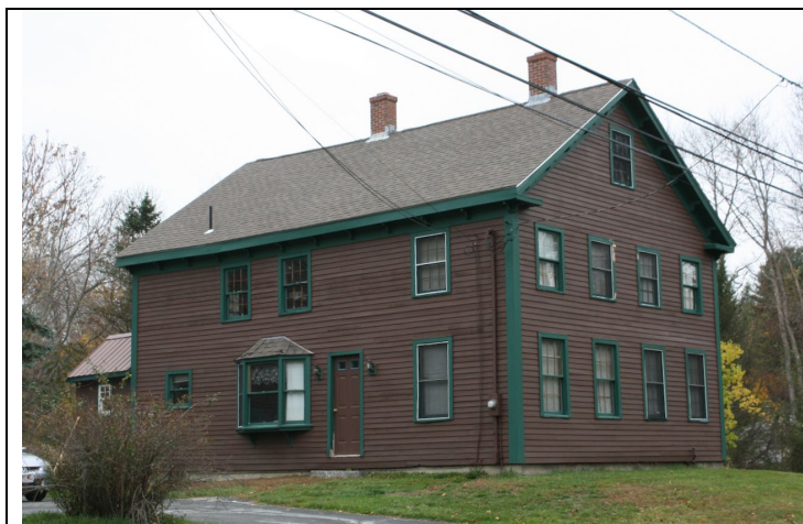
Photo 2. South and east elevations.

Walker, George H. & Co. Atlas of Essex County . Boston: George H. Walker & Co., 1884.