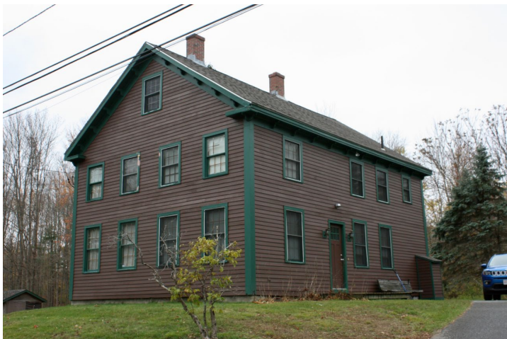
Photo 1. East and north elevations.