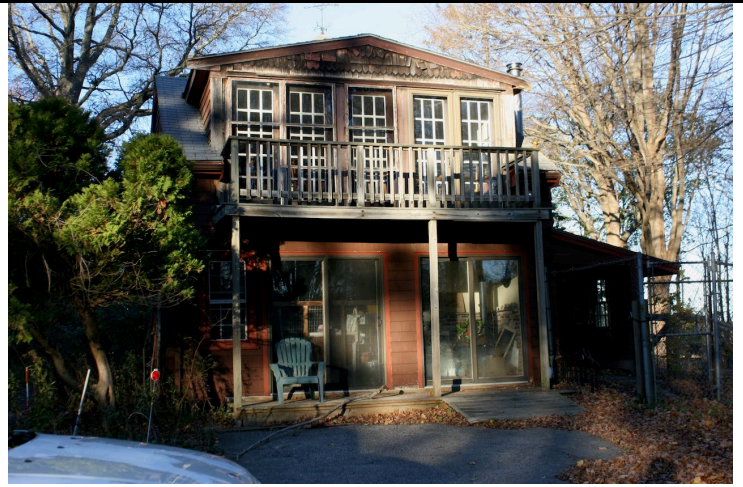
Photo 5. Southwest elevation of south addition.