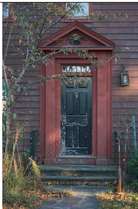
Photo 3. Detail of main entrance.