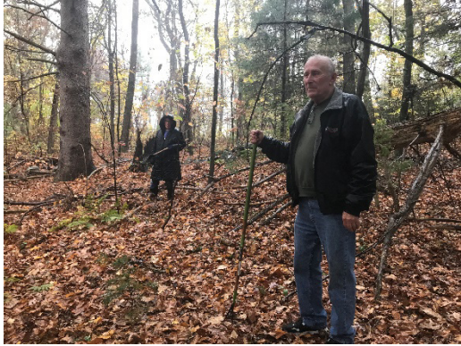
Historical Commission at Alms house Cemetery November 2020, before cleanup.