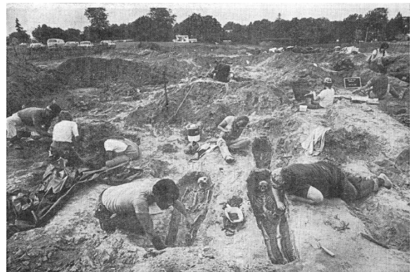
Alms house Cemetery in Rochester, NY, under excavation after having encountered a bulldozer